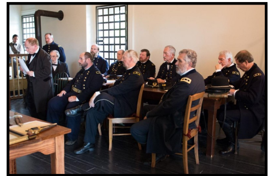
150th anniversary of trial of conspirators with living history program in courtroom

The final project for our 25 th Anniversary year is a straight interpretative project at a well maintained and silent sentinel of the war, Fort Branch in Hamilton, NC. This earthen fortification has been meticulously maintained on private property and has a marvelous small museum on site. Tours are conducted using a coded map with numbered signs around the fort. We see enormous interpretative potential there and believe we will place approximately 30 signs there and develop a site brochure that will assist people with understanding the fort, its role and the role of southern gunboats, such as the Neuse and Albemarle, on the North Carolina rivers. We expect this project to come in at around $16,000.