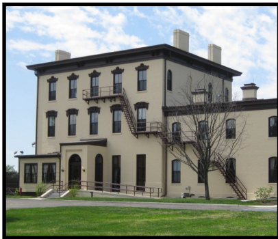
Old Penitentiary building where Lincoln conspirators were held and tried. Today called Grant Hall on Fort McNair base Washington, DC.

The second project is at Fort McNair, which was the site of the Washington Penitentiary, here is more than 200 years of American history—few buildings remain. Grant Hall is the site of the courtroom where the Lincoln Conspirators were tried and executed in July 1865. A partial restoration has been done and the site is open one weekend a month. BGES will finish the restoration, acquiring various artifacts that have been documented to be there and developing and installing interpretative signage that will help you stand in the shadows of the gallows. This humbling story will be explained in a visitors brochure that we will develop and distribute through the army. We believe the project is going to be in the $30,000 to $35,000 range. Approval to go ahead rests at the Lieutenant General level and may involve the Secretary of the Army. It is a high visibility project involving a genuine artifact of the period.