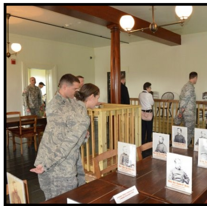
Touring interior of partially restored courtroom.