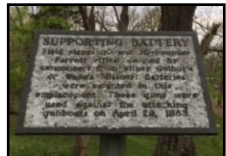
Sign in need of restoration at Grand Gulf

We are adding three projects which should all be completed by this time next year. The first project is to spruce up the interpretative display at Grand Gulf State Park in Mississippi. Here on April 29, 1863 naval forces under David Dixon Porter battled Confederate forts Wade and Cobun. Our work there will be to revitalize the 31 cast iron markers installed so many years ago. Our vendor will scrape the existing paint from the signs and will repaint them, any markers found to be damaged or needing repair will be replaced.