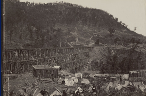
Pass in Raccoon Range

Check out the results from last week's Medford Photo #59, then scroll down to see this week's mystery Medford Photo #60—and email us what you know!