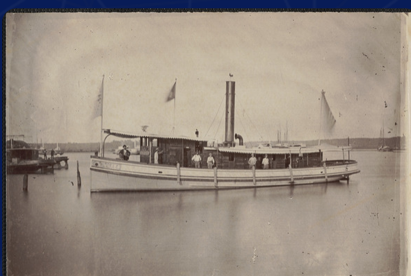
The USS Steamer (Tugboat?) Clyde

Check out the results from last week's Medford Photo #58, then scroll down to see this week's mystery Medford Photo #59—and email us what you know!