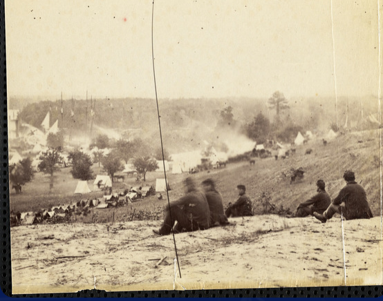
Encampment of Army of the Potomac at Cumberland Landing, Pamunkey River

Check out the results from last week's Medford Photo #56, then scroll down to see this week's mystery Medford Photo #57—and email us what you know!