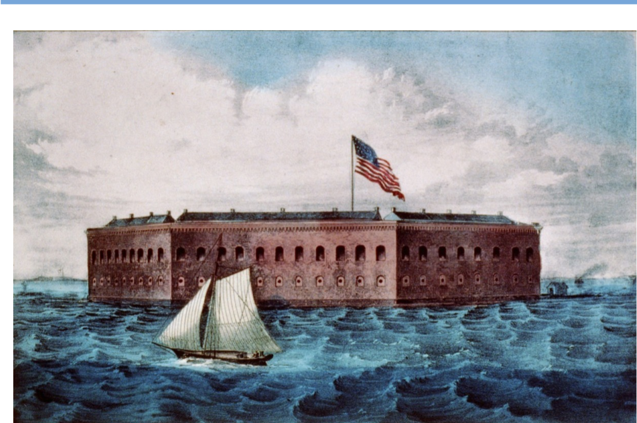
Fort Sumter, by Currier & Ives