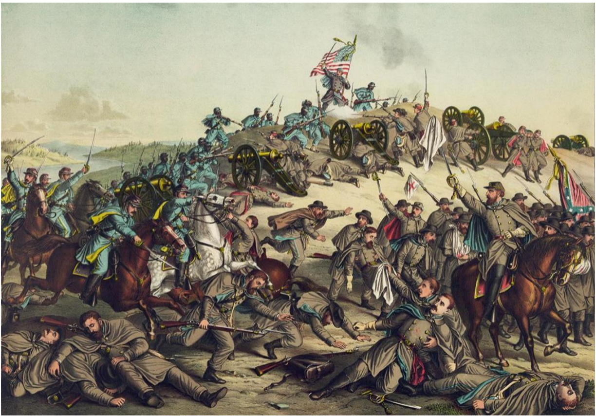
Battle of Nashville

There is one more thing of note that occurred after the meeting. Upon leaving Thomas, Hood spoke with the lady who had been his intermediary. He told her, "Thomas is a grand man. He should have remained with us where he would have been appreciated—and loved."