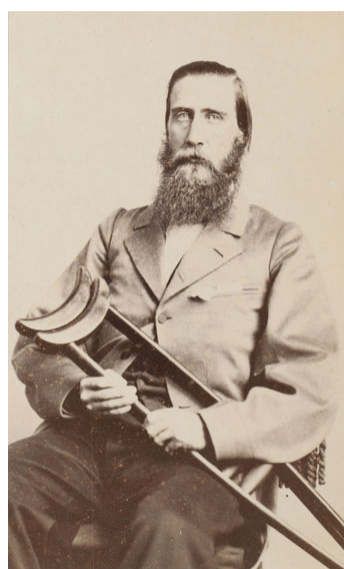
Gen. John Bell Hood