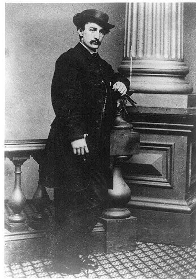
John Wilkes Booth