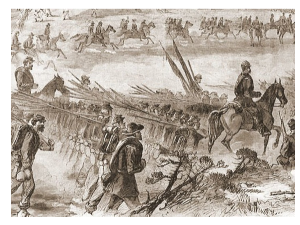
Sherman's army on the march