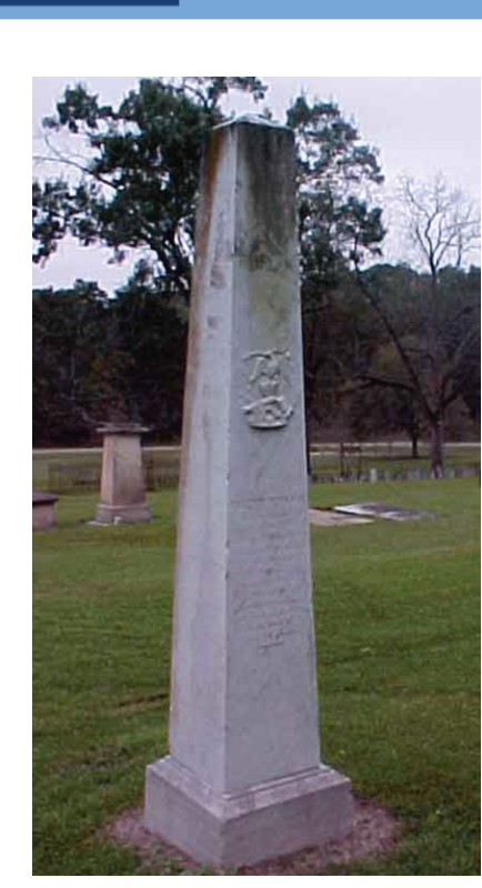
The obelisk