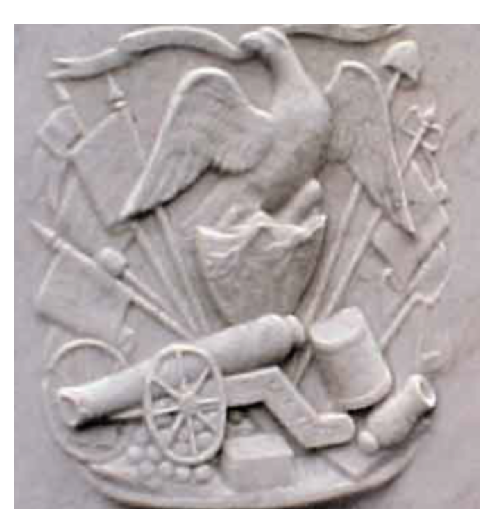
Obelisk detail