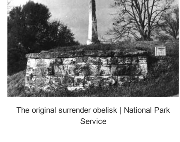
The surrender site monument was put on site near the 3rd Louisiana Redan on the Vicksburg