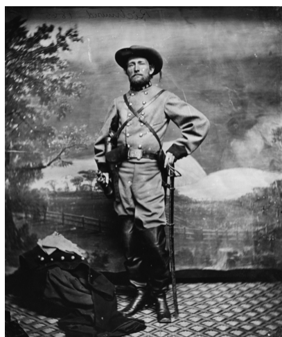
John S. Mosby, Richmond 1865

Mosby realized that making his name feared would give his warfare greater emotional impact. He insisted that his men make it clear when they attacked that they were "Mosby's Men." Rangers learned that the word Mosby was so powerful that it was useful in subduing a guard and preventing him from yelling or shooting. "I am Mosby," a Ranger would whisper, and sometimes the captive would go into a daze, bowing his head and trembling in fear. When ordered to walk, prisoners staggered as if drunk, some became nauseated and vomited, and others fell on their knees and raised their hands, pleading for their lives. When a Union soldier disappeared, his friends would say that "Mosby had gobbled him up."