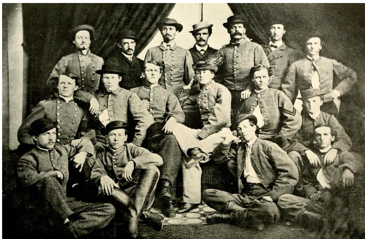
John S. Mosby and Some of His Men, 1863

Confederate Col. John Mosby and his men wore their Confederate uniforms on missions so that they could claim their rights as prisoners of war if captured. However, they always were accused of masquerading as the enemy. Why? Perhaps because during cold weather, they wore dark overcoats, and when they had Union prisoners, they would place them in front to create the appearance of Union cavalry. They usually marched in a leisurely style, like friends out for a ride, but for disguise they would form column of fours and appear to be well-drilled blueclads. Furthermore, when it rained, they wore dark rubber ponchos, which were standard issue for both North and South, convenient for approaching the enemy with revolvers drawn, concealed under the rain garments.