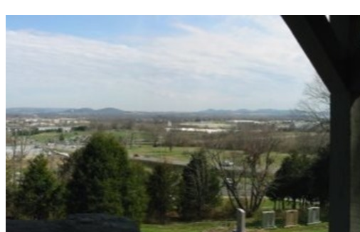
Winstead Hill, Franklin

Here we are 150-plus years after American innocence was shattered, only to be rebuilt and revitalized. But it took time. As Americans grappled with the internal changes wrought by the war, we industrialized our nation, invented electricity, automobiles, airplanes, telephones, defeated Nazism, fought Communism every step of the way, built an interstate highway system, walked on the Moon, introduced the world to the Internet, and yes, we finally got Osama bin Laden. We also finally began to deal with the issues of race, something that took generations to fully confront and brought with it some of the lingering pain from the Civil War.