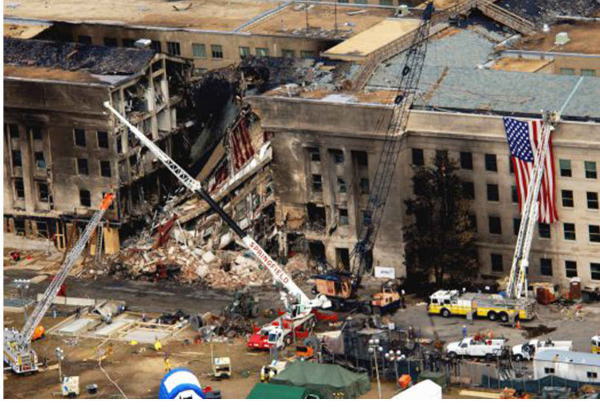
Aerial view of Pentagon devastation on Sept. 11, 2001

We must never forget the importance of what happened at places like Manassas, Vicksburg, Atlanta, Gettysburg, Wilson's Creek, and, of course, Franklin. We can never forget the impact made by the likes of Lee, Sherman, Forrest, Grant, Lincoln, and Davis. We read again and again the words of men such as Watkins and Bierce. We live with the echoes of the Civil War in our daily lives, on the streets we drive in old towns and cities, with the statues and monuments we pass, and in the cemeteries that dot the American landscape. There are the alleged heroes and villains, there are the stories of virtue and wrong, and there are discussions about the proper role of government, from local to state to federal. There is the issue of race and of the ever changing face of America. What does it all mean?