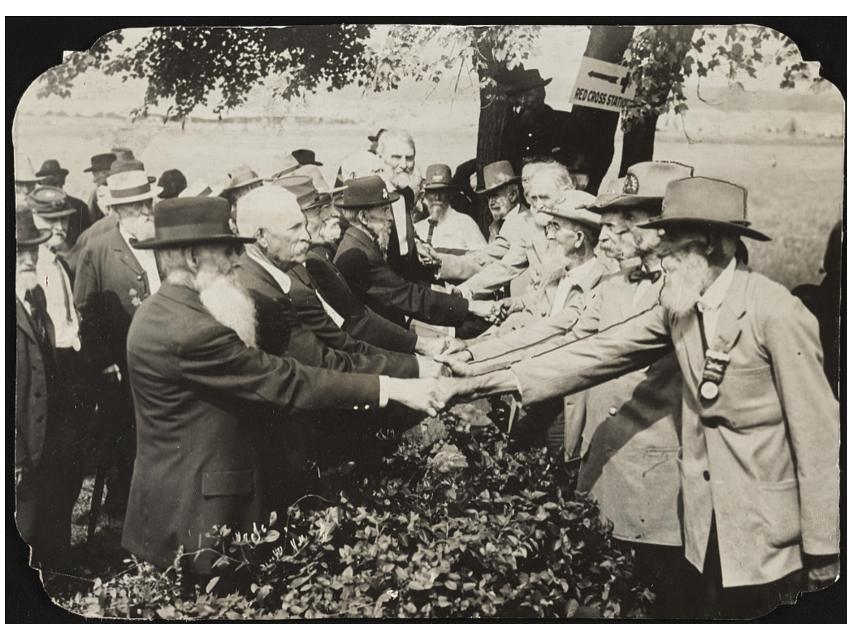
Gettysburg reunion, 1912

A century and a half ago, we stood on the precipice. We endured, and the soldiers from both sides helped to rebuild America. Their legacy is alive in all of us today, even if America became your home long after the guns of the Civil War were silent.