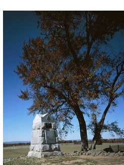
The Angle, Gettysburg