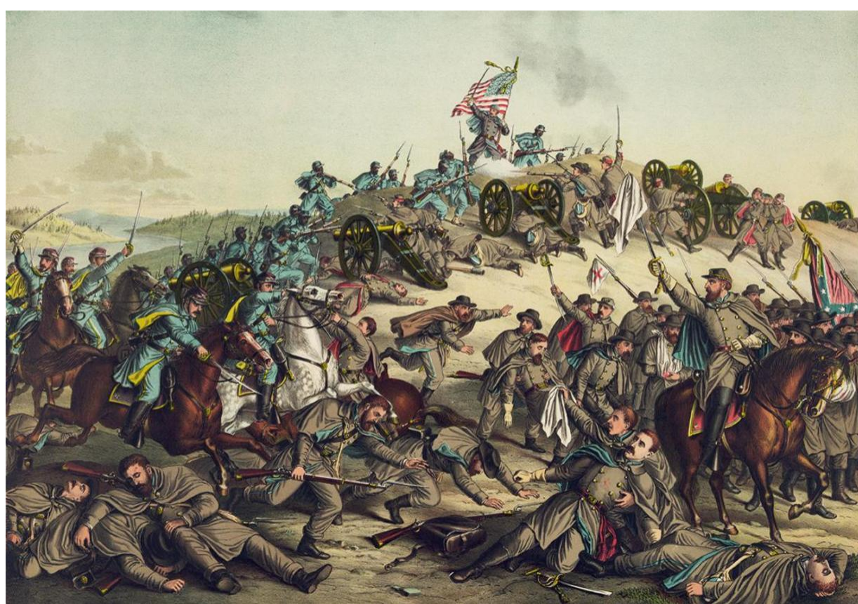
Battle of Nashville

There is one more thing of note that occurred after the meeting. Upon leaving Thomas, Hood spoke with the lady who had been his intermediary. He told her, "Thomas is a grand man. He should have remained with us where he would have been appreciated—and loved."