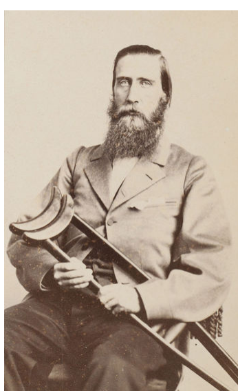
Gen. John Bell Hood | CivilWarTalk.com