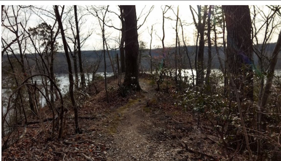
Blockhouse Point, with the Potomac below and Virginia beyond

Blockhouse Point Conservation Park is a county-run park in Montgomery County, Maryland, just northwest of Washington, D.C. While it includes several miles of hiking and horse trails, the park preserves, as the name suggests, the site of a Civil War blockhouse