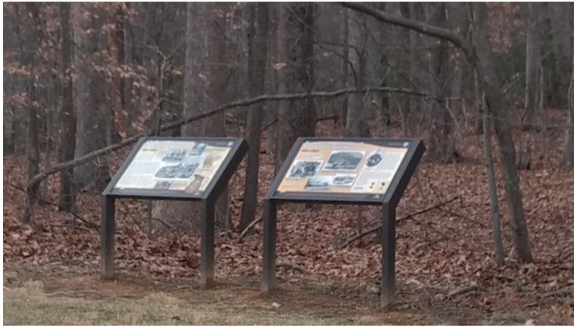
Interpretive signs explain the area's history

Union forces arrived here that first year of the war to set up camp. From this isolated outpost, Union troops patrolled the Chesapeake and Ohio Canal, the Potomac River, and nearby roads. They drilled and performed routine camp duties. They interacted with unsympathetic civilians. They explored the hills and valleys in their leisure time. And they likely pondered the movements of the large armies that were making headlines, knowing full well that their trials and tribulations were not being captured for posterity