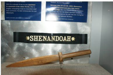
A Shenandoah sailor's knife at the U.S. Naval Academy Museum in Annapolis

The story does not end there, as a number of articles from the CSS Shenandoah remain on display across America today, reminding us of this tidbit of history.