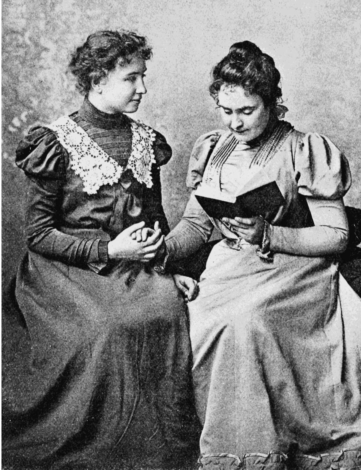
Helen Keller with her lifelong teacher, Anne Sullivan, in 1899, in a photograph taken by Alexander Graham Bell