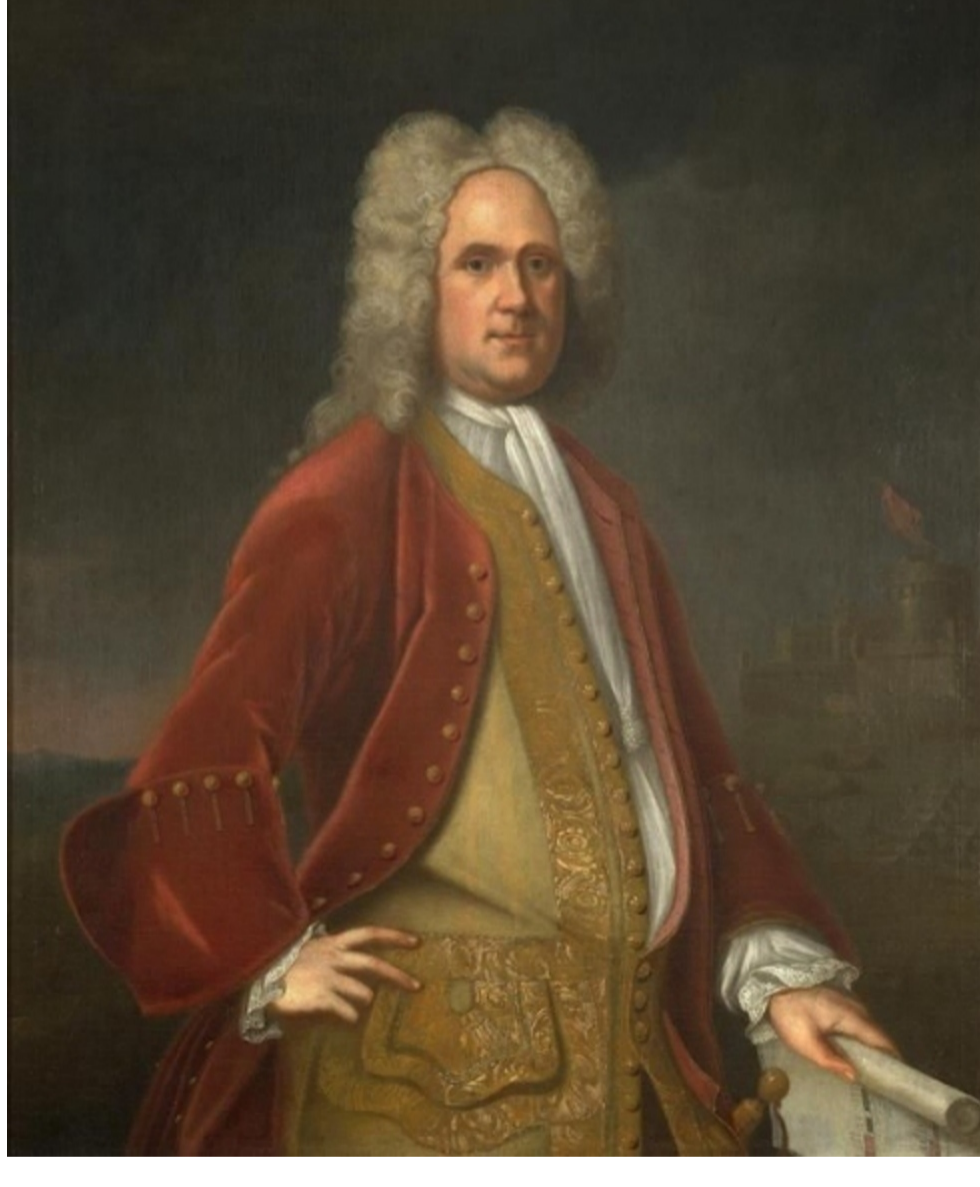
Gov. Alexander Spotswood | public domain