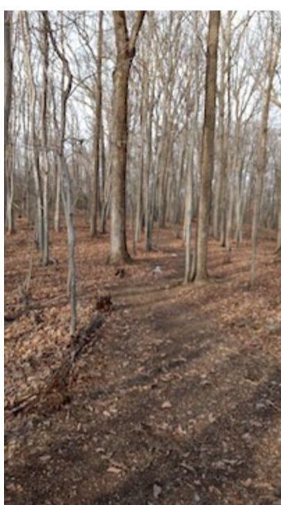
One of the many trails at Blockhouse Point Conservation Park in Maryland.

For those interested, Blockhouse Point Conservation Park is located off River Road in Montgomery County, Maryland. The park is open during daylight hours. Its website, with trail information and a historical summary, is here: Blockhouse Point .