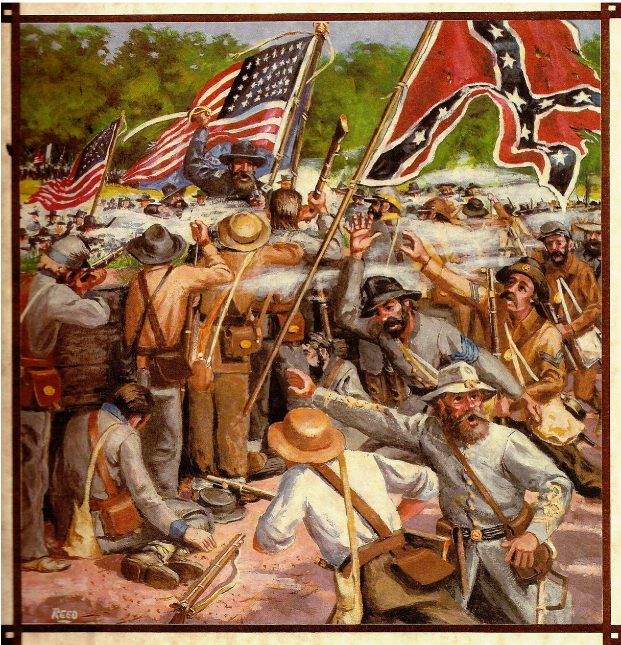
Battle of Selma, part of the Union campaign through Alabama and Georgia, 1865

You can learn about history such as this by reading these dispatches and participating in BGES tours.