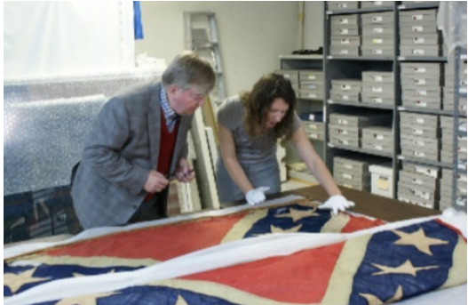
Shenandoah 's flag, at the American Civil War Museum in Richmond