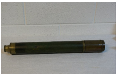
Captain Waddell's telescope, at the American Civil War Museum in Richmond