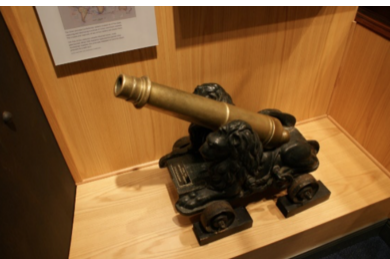
Shenandoah 's signal gun, at the U.S. Naval Academy Museum in Annapolis