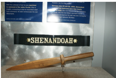
A Shenandoah sailor's knife at the U.S. Naval Academy Museum in Annapolis

The story does not end there, as a number of articles from the CSS Shenandoah remain on display across America today, reminding us of this tidbit of history.