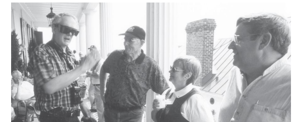
In a home on Charleston's Battery